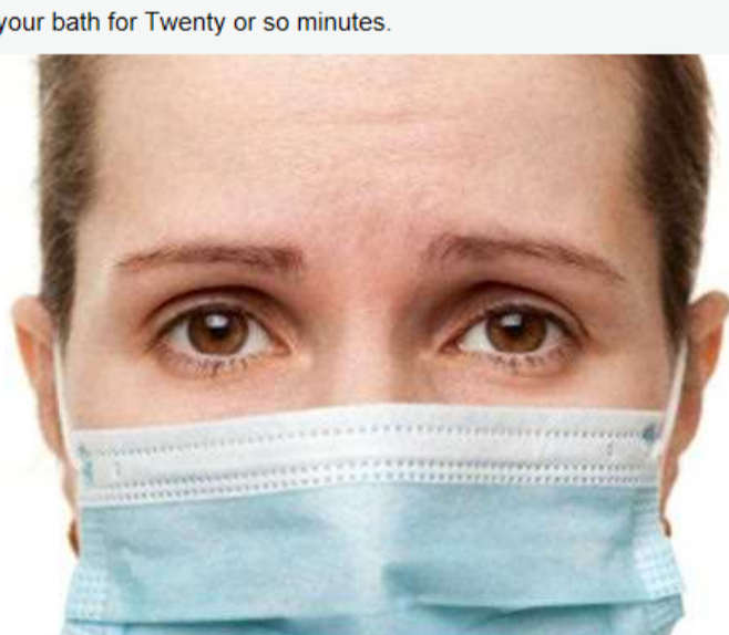
Severe Bleeding Hemorrhoids

Although hemorrhoids are hardly ever life threatening, they can cause intolerable pains in the rear end area. Factors leading to Hemorrhoid are sitting at one place for long times, obesity, pregnancy, bring about and irregular diet pattern. Signs of this disorder are passage of blood in barstools, mucus passage from the anus, protrusion of mass through anus, irritation, itching and pain in the butt. (Click here to learn how to get rid of the signs of hemorrhoids permanently)