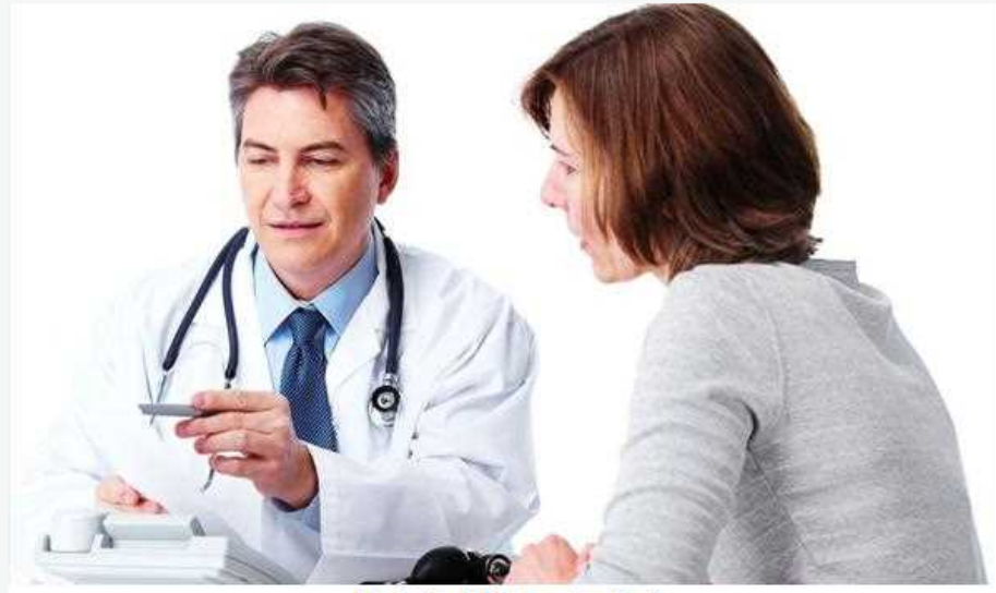
Painful Piles Relief

There tend to be so many remedies in there that if you do not find something that works for you then there is a good chance that no home or natural remedy will; however, after reading the guide, we believe that there is something in there for everyone. It's really a very concisely written help book on natural ways of relieving, healing, preventing and getting rid of hemorrhoids permanently.