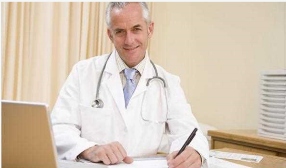
HemorrhoidsPilesFixing HemorrhoidsInternal HemorrhoidsExternal