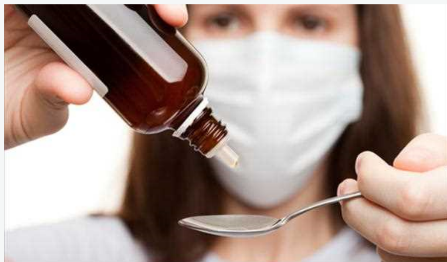
HemorrhoidsInternal HemorrhoidsExternal HemorrhoidsHemorrhoid

As for internal hemorrhoids, victims can feel additional straining during actions and discover blood traces in the anal area. For many people the effect is a feeling of the need to excrete more even though all solid waste has been evacuated. If not treated then a hemorrhoid can start to develop into a lump on the external part of the anal sphincter. As is the case with internal hemorrhoids, as soon as you feel regular and ongoing discomfort or find traces of blood in your stools then you should refer yourself in order to a doctor.