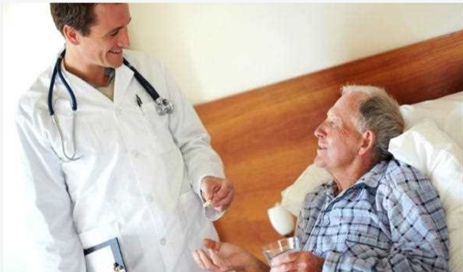
HemorrhoidsHemorrhoidHemorrhoid TreatmentInternal HemorrhoidsPilesHemroidBowel

One of the main justifications why you need to seriously consider natural cures for hemorrhoids is the established fact that several known and popular treatment alternatives negatively impact on the blood sugar level. This makes hemorrhoid treatment for diabetics a very sensitive medical issue.