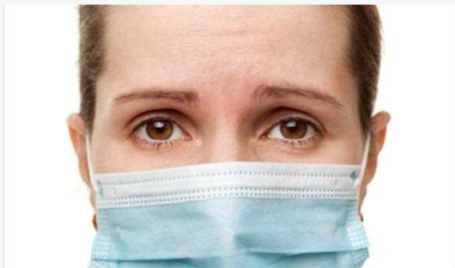
HemorrhoidsHemorrhoidExternal HemorrhoidsInternal HemorrhoidsCure

Infrared coagulation - this is a process of burning up the thrombosed hemorrhoid by using infrared lighting.