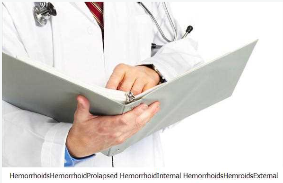
HemorrhoidsHemorrhoidProlapsed HemorrhoidInternal HemorrhoidsHemroidsExternal

Your doctor will most likely identify the prolapse in terms of "stages" such as stage I or stage IV. All that this means is just how severe the hemorrhoid is. A stage I internal hemorrhoid means that it hasn't prolapsed at all. Stage II means that the hemorrhoid pokes out when muscle pressure is actually applied but it is going right back in on its own. Stage III describes a hemorrhoid that won't go back in by itself but will always be in once sent with a finger. A stage IV hemorrhoid catapults outside the body all of the time and will not stay inside the body for any length of time.