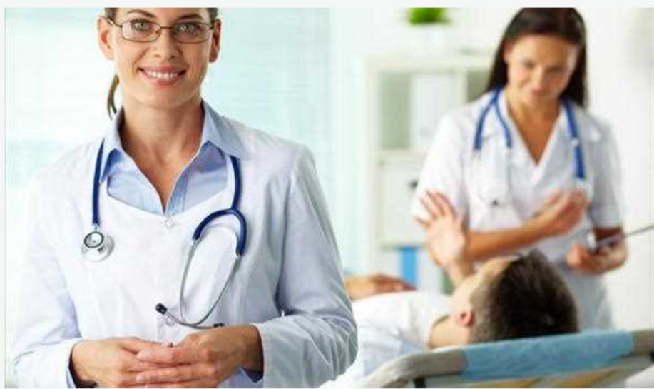
HemorrhoidHemorrhoid TreatmentInternal Hemorrhoid TreatmentHemorrhoidsPile

You need to strengthen your veins and you also need to provide soothing relief as a part of your internal hemorrhoid treatment. These are important components as well. However, if you do not stop the big contributing factor of poor blood circulation and cleanliness, it is only a matter of time before you are in need of an internal hemorrhoid treatment however again.