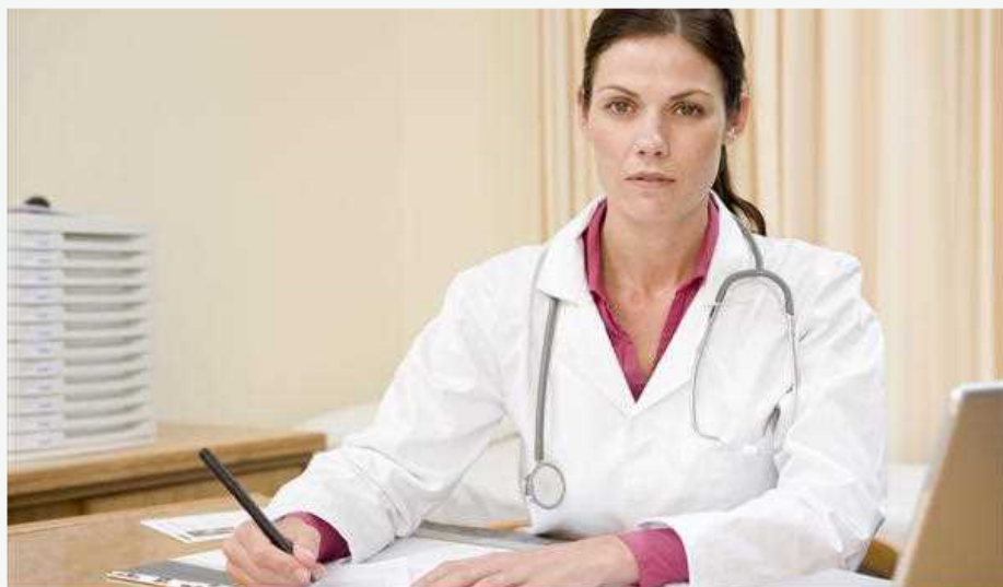
HemorrhoidHemorrhoidsHemorrhoid TreatmentExternal HemorrhoidsPilesExternal

Regardless of the treatment approach you decide on, hemorrhoids cure are almost anywhere these days. Due to the increasing prevalence of the situation, you can easily get the treatment you need at your local drugstore. But this kind of ubiquity doesn't count the fact that patients continue to be more or less embarrassed when talking about their condition.