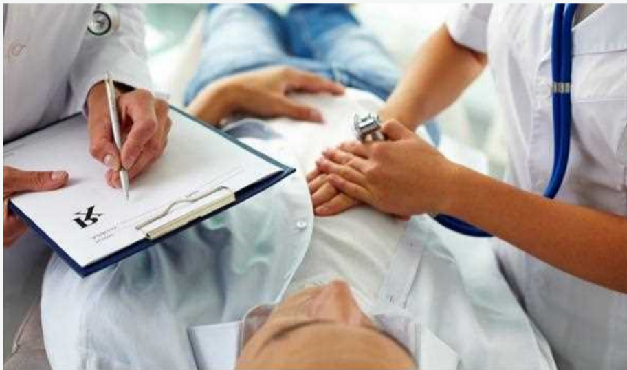
Hemorrhoids External Hemorrhoids

People tend to be susceptible to hemorrhoids tend to be those who reach the age of forty and who exercise a smaller amount frequently than prior to. Additionally, constipation and diarrhea occur more often lessening the effectiveness of the digestive system. When this happens, it will put more stress on a person's body and swollen veins may grow and become inflamed rapidly. For these reasons, this herbal remedy was developed to relieve people of their unpleasant and painful signs. The what are used are witch hazel leaf and bark extract, horse chestnut seed extract, and biliberry.