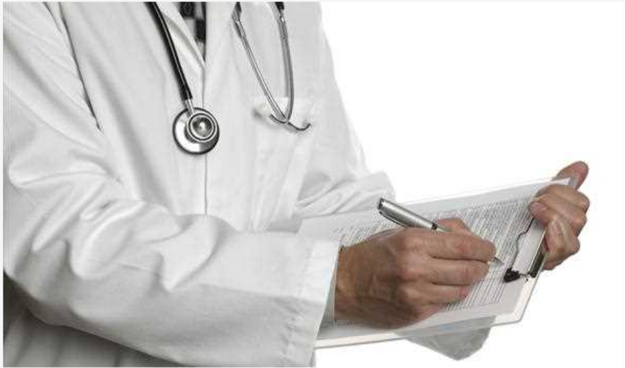
HemorrhoidsHemorrhoidExternal HemorrhoidsInternal HemorrhoidsPiles