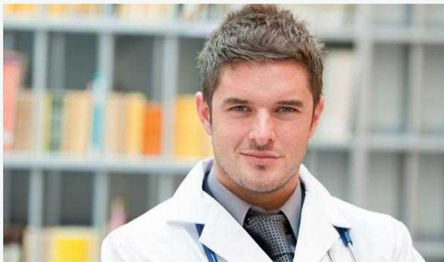
HemorrhoidsHemorrhoidHemorrhoid TreatmentNatural Hemorrhoid