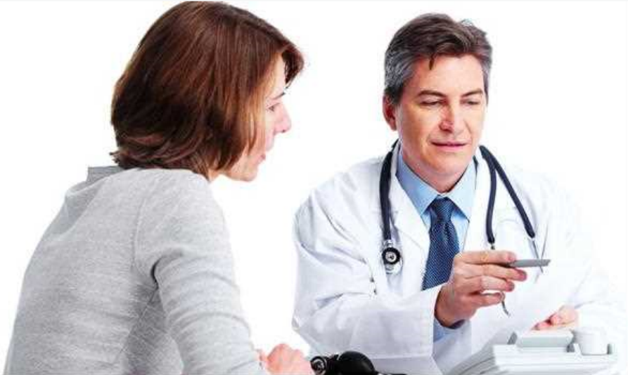
HemorrhoidsHemorrhoidHemorrhoid ReliefExternal HemorrhoidsPiles