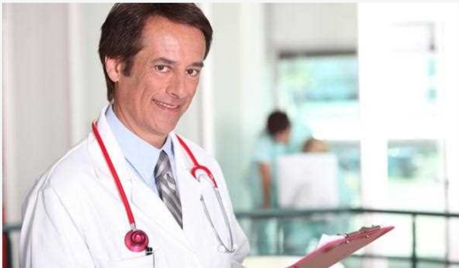
HemorrhoidsSitz Bath HemorrhoidsHemorrhoid